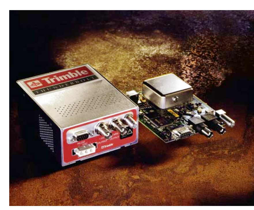
Trimble's Thunderbolt GPS Disciplined Clock in enclosure, and board form.

Trimble's approach is unique. The Thunderbolt GPS Clock outputs a 10 MHz reference signal and a 1 PPS signal with an over-determined solution synchronized to GPS or UTC time. The 10 MHz reference accommodates applications requiring sub-microsecond timing. A single microprocessor per-